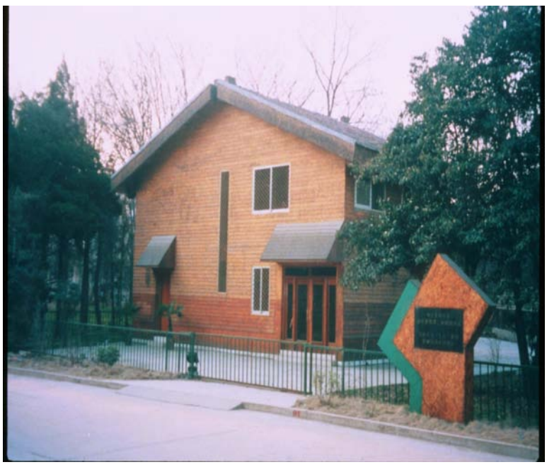
Nanjing OSB house

After almost eight years of travel in China, I believe I had convinced the Chinese Ministry of Construction (and their technical experts) that a wood frame building code needs to be developed to help address their housing demand. The model for this code was to be the National Design Specification for Wood Construction (by AF&PA, American Wood Council). By 2003 the wood frame code in China was in place.