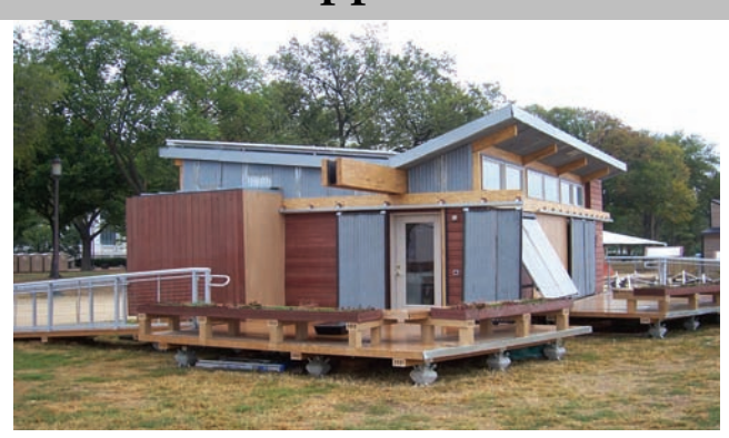
WSU solar decathlon house, on site in Washington DC, constructed with wood plastic composites fabricated at WMEL (2005)